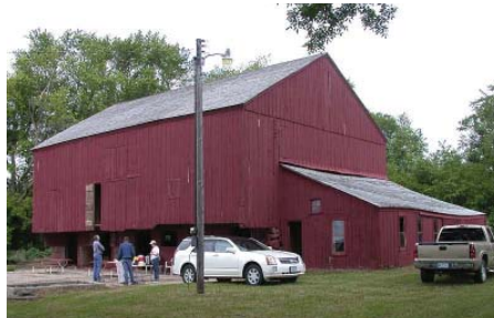
Lorch Mennonite barn