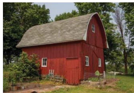
Sharon Center barn

Owners will be eligible for a $500 grant to go toward paying for preparation needed before painting.