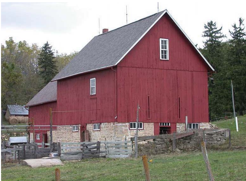
Chimney Rock Ranch barn

8.4 miles (Centennial becomes W 46). Turn left on 150th Street. Go 1.7 miles to Palmer barn. Rock is from nearby quarry using teams and wagons. Framing of barn was oak harvested from own woodlands. Portable sawmill was brought to saw logs. Some 200-300 men came for a one day barn raising; each man given a new hammer.