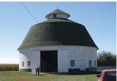
Dobbins round barn