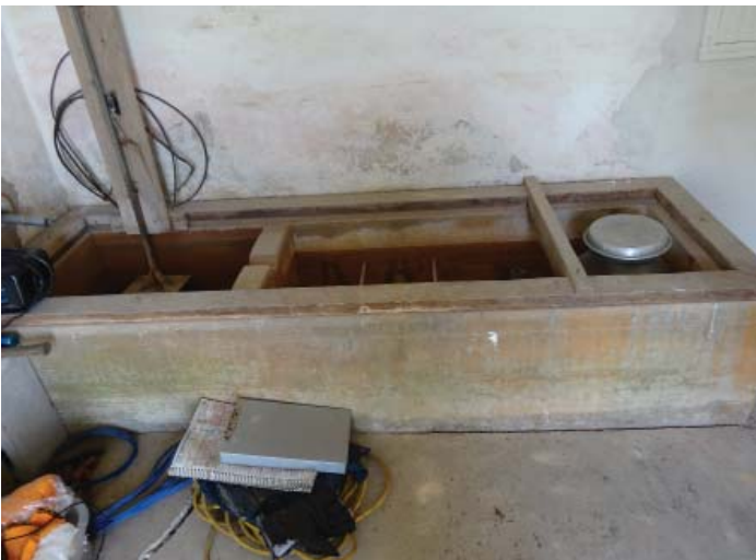
Milk House Water Tank in Milk House, James Boeding Ansten Farm, Winneshiek County, Iowa.