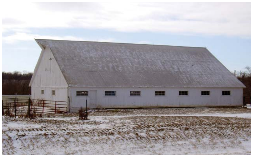
Old Iowa State barn