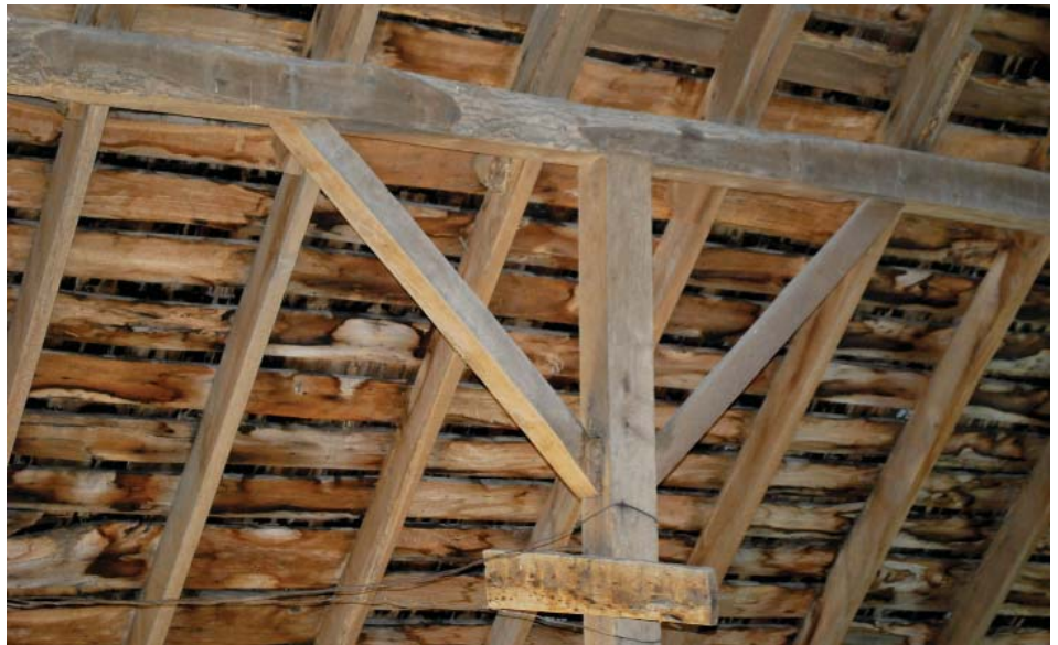
Smith barn, interior