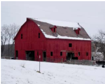
Shetland Pony barn