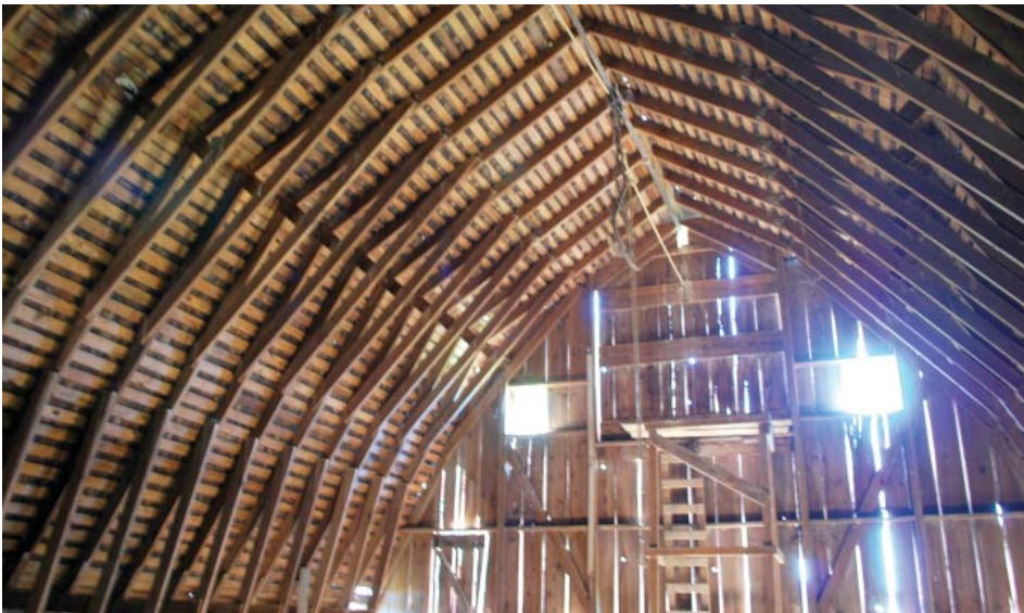
Blake barn, interior